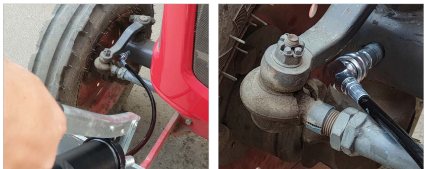
Convenient access into narrow, inaccessible greasing joints